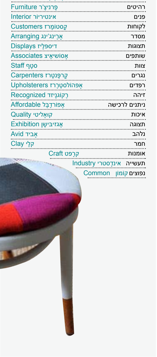
PART OF OUR HISTORY